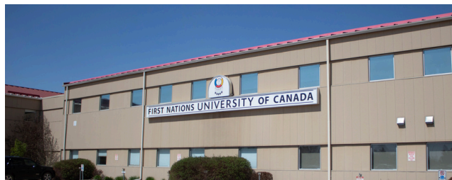
Asimakaniseekan Askiy Urban Reserve

230 – 103B Packham Avenue Saskatoon, SK S7N 4K4