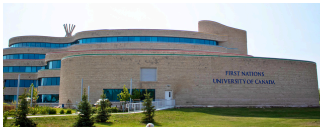
atim kâ-mihkosit (Red Dog) Urban Reserve