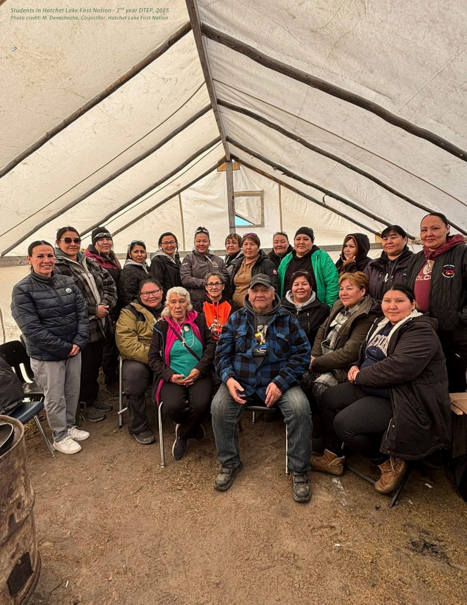
Students in Hatchet Lake First Nation - 2 nd year DTEP, 2025