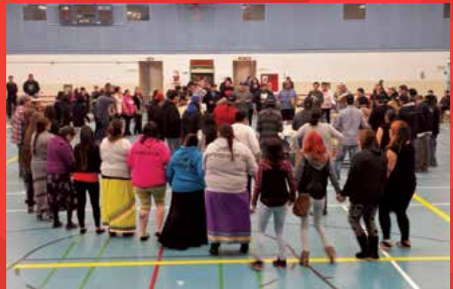
FNUUNIV – PRINCE ALBERT CAMPUS STUDENTS, FACULTY AND STAFF JOIN COMMUNITY MEMBERS AT THE 2015 NORTHERN CAMPUS STUDENT ASSOCIATION ROUND DANCE.

One of the messages that our students share with us all the time is that they are grateful for FNUUniv's sense of community, which is enriched through student gatherings like the round dance that the FNUUniv Northern Campus Student Association hosted this past March.