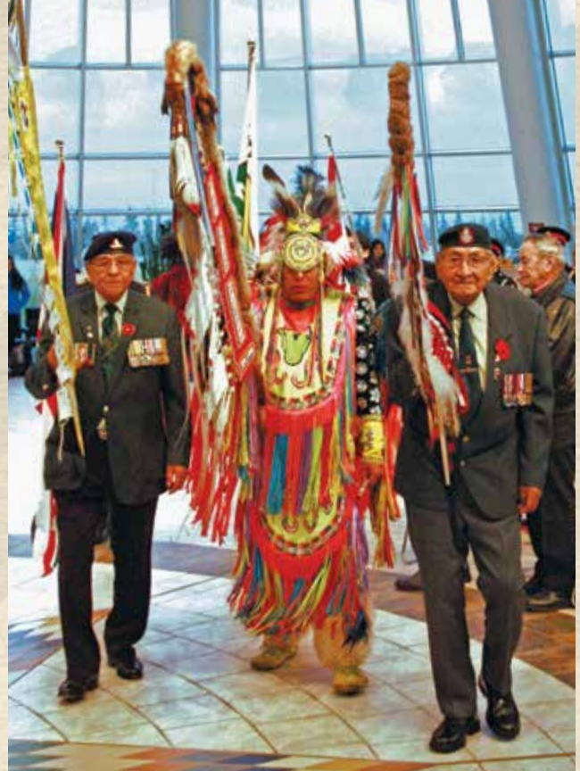
FNUNIV HONOURS FIRST NATIONS VETERANS AND THEIR SACRIFICES AT OUR ANNUAL REMEMBRANCE DAY SERVICE IN THE VETERANS MEMORIAL TIPI.