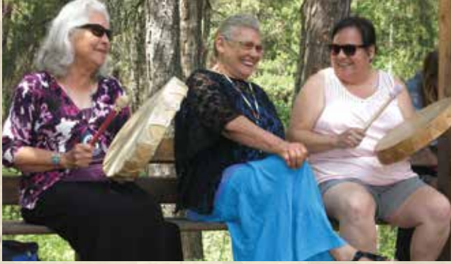
FNUNIV PROGRAMS INCLUDE DISTINCT CULTURAL EXPERIENCES SUCH AS ELDER-LED, LAND-BASED EXPERIENCES.