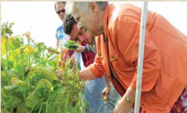
TRADITIONAL TEACHINGS BY FNUNIV ELDERS UNDERPIN MANY OF FNUNIV'S COURSES – ENSURING INDIGENOUS KNOWLEDGE GETS PASSED ON TO NEW GENERATIONS.