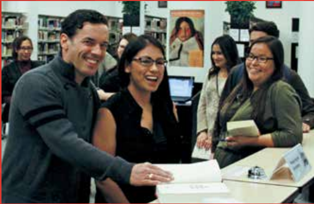
AUTHOR JOSEPH BOYDEN (LEFT) SHARES SOME LAUGHTER AND WRITING TIPS WITH STUDENTS DURING HIS VISIT TO FNUUNIV.